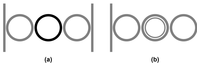
Fig. 1 Two approaches to frequency trimming at fabrication. (a) When a maskless lithography technique is used such as scanning-electron-beam lithography, the exposure dose of a given resonator can be altered to introduce slight dimensional changes resulting in precise resonant frequency trimming. (b) When a mask-based lithography is employed such as optical projection lithography or nano-imprint lithography, a non-resonant dielectric structure evanescently coupled to the resonant mode is introduced to precisely modify the resonant frequency of the micro-cavity.

The two main approaches to frequency correction are shown in Fig. 1. Third-order microring filters are used for illustration purposes but the techniques are applicable to all microphotonic resonators. If a maskless lithography technique such as scanning-electron-beam lithography (SEBL) is used, a small and accurate dimensional alteration can be introduced by changing the exposure dose of a given resonator. In Fig. 1(a), increasing the exposure dose of