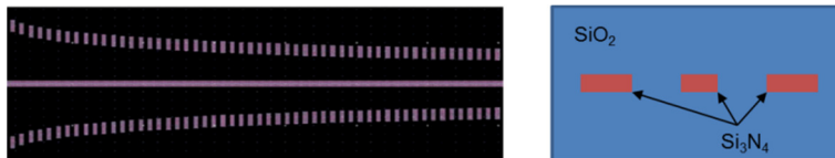
Fig. 1. (Left) Top-view schematic of double-chirped grating, with nitride waveguides represented in pink. (Right) Cross-section of grating.

The grating is formed by periodically introducing small blocks of nitride at the edges of the central waveguide, to introduce a perturbation to the effective index of the waveguide mode. This approach allows the strength of the perturbation to be widely tuned, by varying the spacing of the blocks with respect to the central waveguide. Chirping of the center wavelength of the grating is implemented by tapering up the width of the central waveguide, such that the effective index of the waveguide mode is increased as a function of length along the device. A top-view schematic of the device and a cross-section of the waveguide are shown in Figure 1. The devices were fabricated in a 300-mm CMOS foundry, using PECVD to grow the nitride layer and optical immersion lithography to pattern the waveguides. The nitride layer thickness was 200nm, with 4 \mu m of SiO 2 above and below the waveguides.